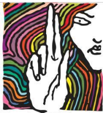
Hungarian Helsinki Committee